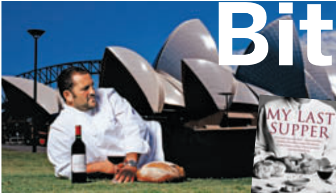
My Last Supper

Icebergs, North Bondi Italian fame] into the eating 'hood as well.